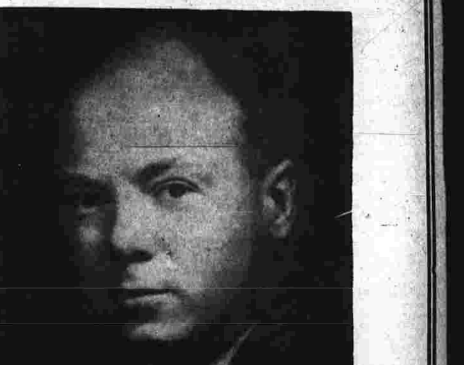
THOMAS E. DEWEY For President

ON THE SAME SHOW— THE LITTLE SECRET END TODAY: "The Impatient Years" PLUS: "JUNGLE WOMAN"